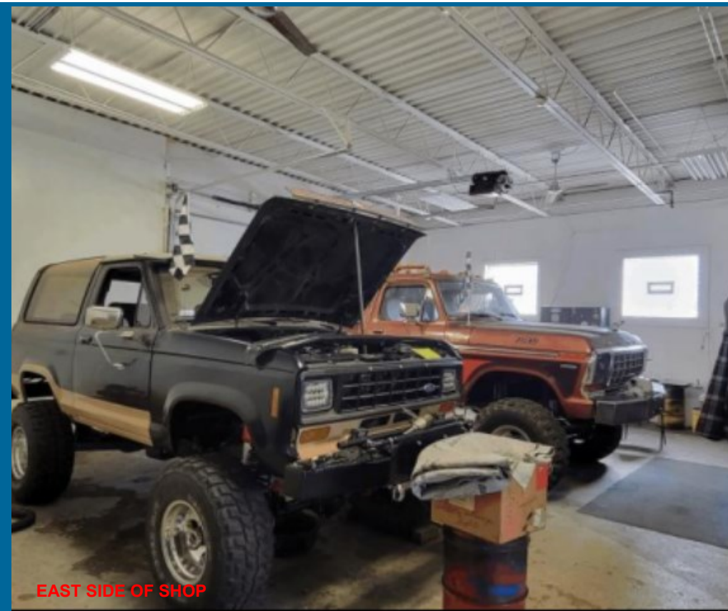
EAST SIDE OF SHOP

Offered By: Tim Billimack & Nicole Kirchberg 815.355.0196 | 815.307.2222 billimack@gmail.com nckirchberg@gmail.com