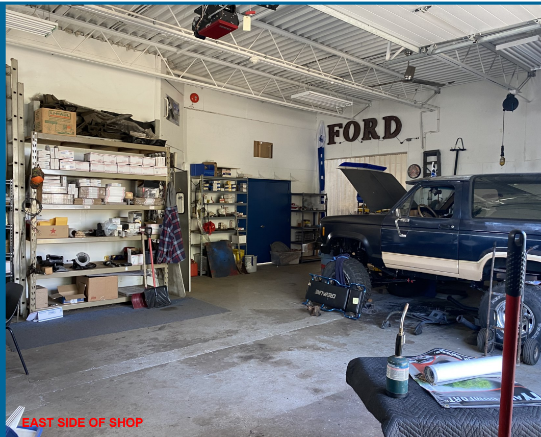
EAST SIDE OF SHOP